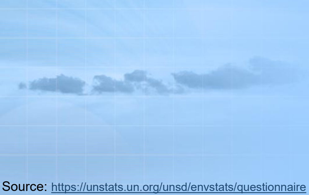
Table R2: Management of Hazardous Waste